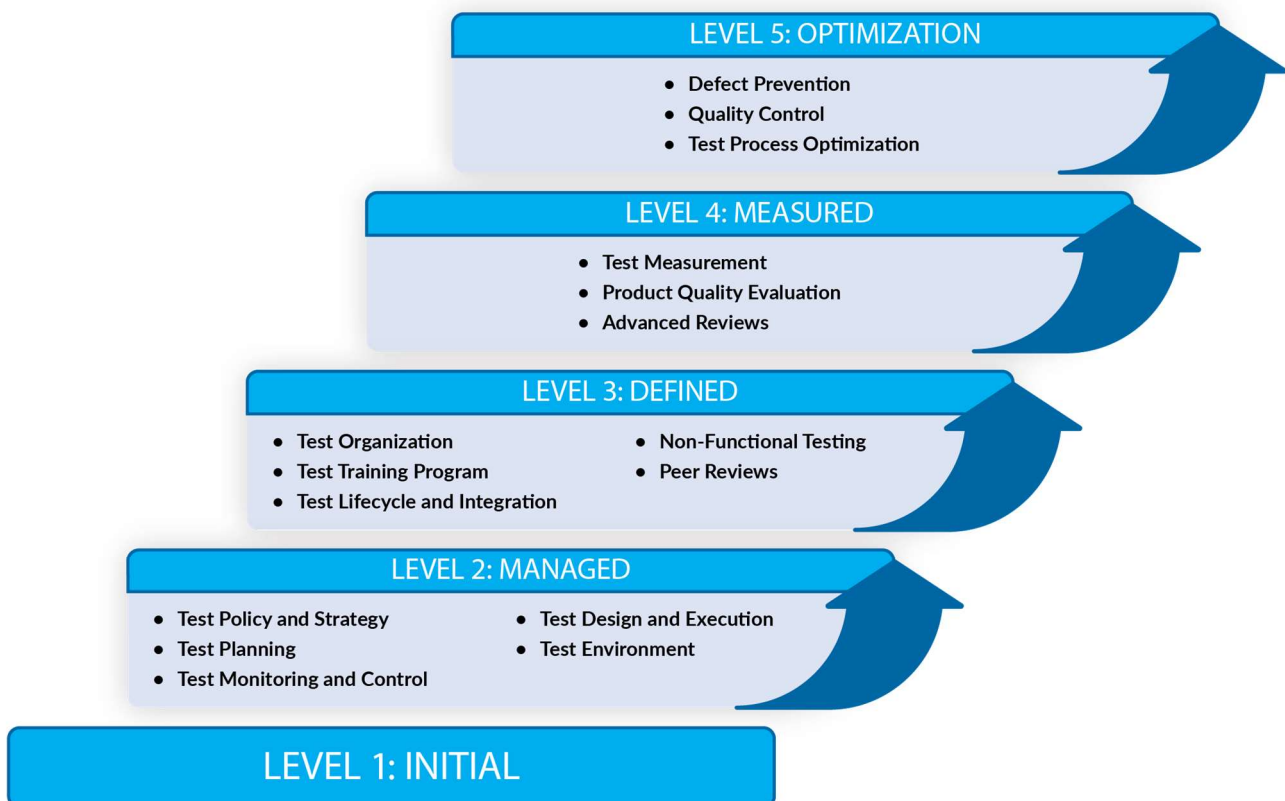
Figure 1: TMMi maturity levels and process areas

The process areas for each maturity level of the TMMi are shown in figure 1. They are fully described later in separate chapters, whilst each level is explained below along with a brief description of the characteristics of an organization at each TMMi level. The description will introduce the reader to the evolutionary path prescribed in the TMMi for test process improvement.